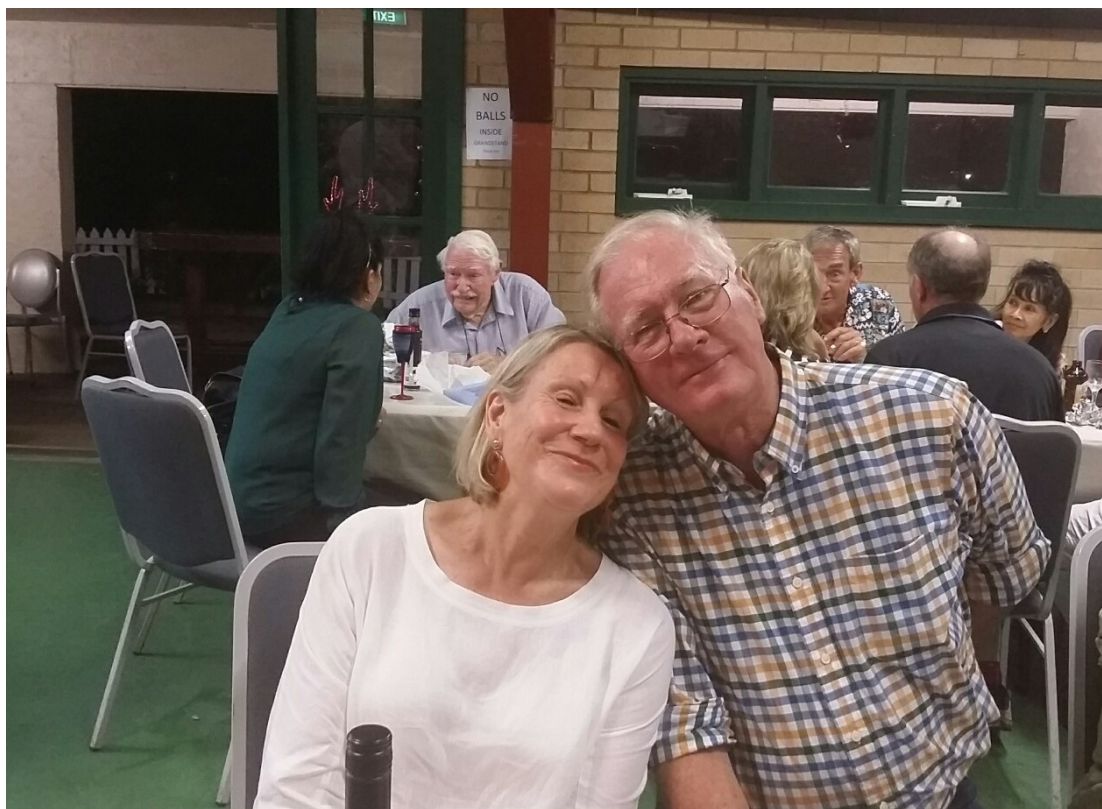
AIN'T LOVE GRAND, NO DOUBT ABOUT THESE TWO!