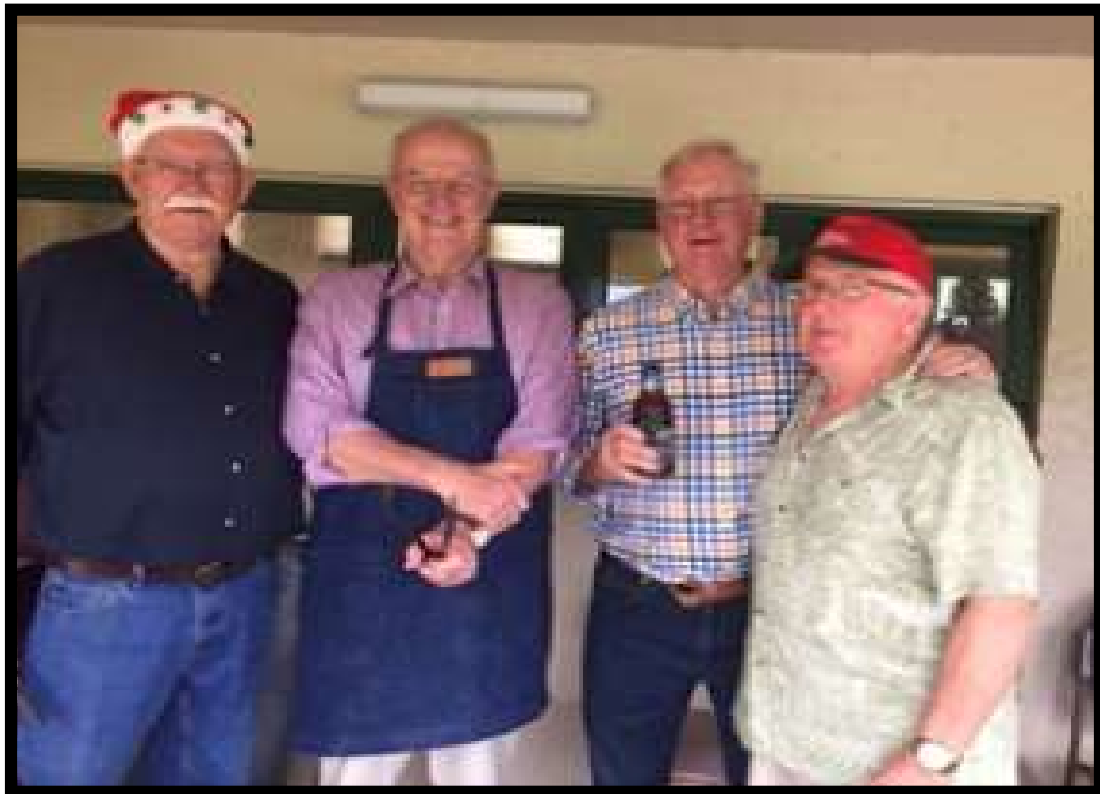
POC'S FROM UNDER THE GRANDSTAND

IT'S BETTER TO HAVE LOVED A SHORT MAN THAN NEVER TO HAVE LOVED ATALL