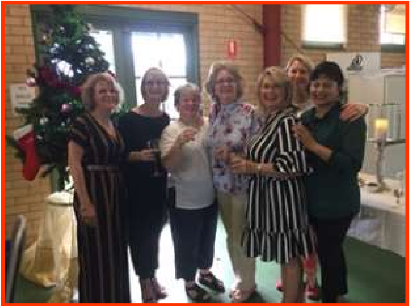
Pic's from the Party